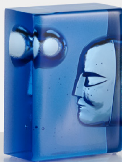
MOON Series "Azur"

7520109 Sculpture H 150 mm W 65 mm L 110 mm Blue