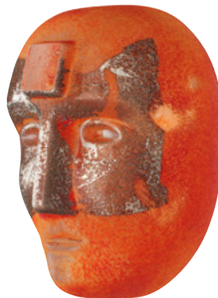
LOOK IN Series "Look"

7520099 Sculpture H 135 mm Ø 85 mm Orange