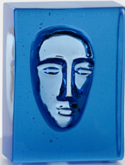
MAN Series "Azur"

7520111 Sculpture H 150 mm W 65 mm L 110 mm Blue