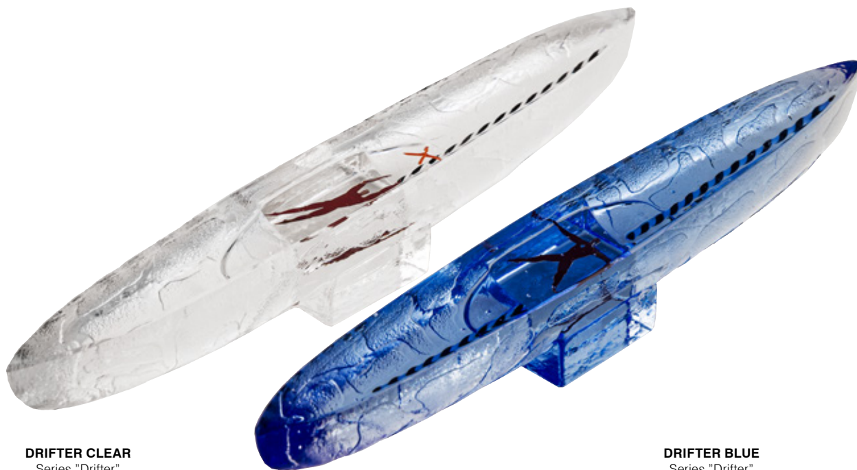
DRIFTER CLEAR Series "Drifter"

Drifter expresses simplicity and space with an encased figure in copper that flows freely in his boat. It is Bertil Vallien's latest form of boats including a black and white glass spiral to which he often returns. Drifter has a base that makes it stand firmly without additional support.