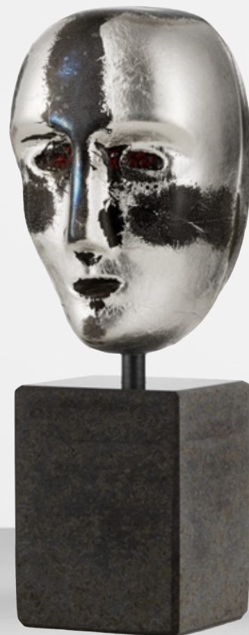
MERCURIUS Series "Brains on Stone"

7520120 Sculpture H 145 mm B 65 mm D 50 mm Gold/red