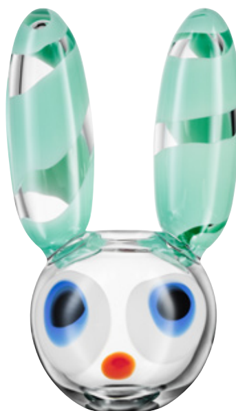
JUST HANGING OUT Serie "What's Up?"

7670009 Sculpture H 275 mm Ø 120 mm Multicolored