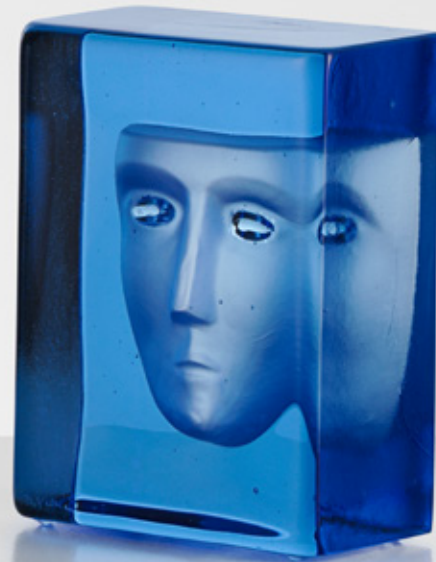
FROST Series "Azur"

7520111 Sculpture H 150 mm W 65 mm L 110 mm Blue