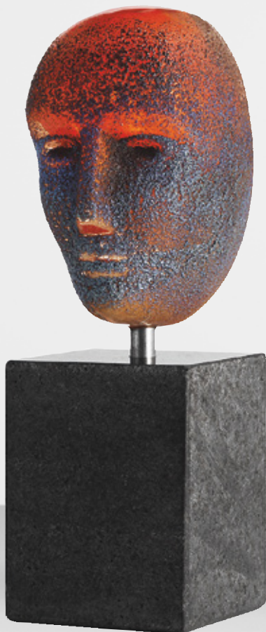
TOR Series "Brains on Stone" 7520102 Sculpture H 135 mm B 55 mm D 45 mm Orange