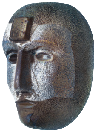
LOOK IN Series "Look"

7091735 Sculpture H 135 mm Ø 85 mm Black/white