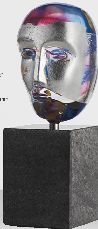
ODEN Series "Brains on Stone"

7520100 Sculpture H 135 mm B 55 mm D 45 mm Multicolored