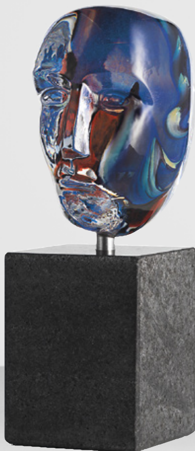
LOKE Series "Brains on Stone"

7520100 Sculpture H 135 mm B 55 mm D 45 mm Multicolored