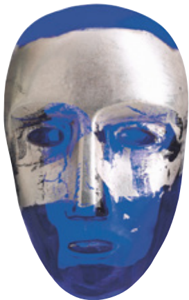
JIMENEZ Series "Brains"

7090307 Sculpture H 75 mm Ø 45 mm Blue/silver