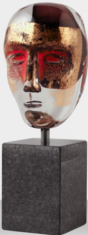
HEFAISTOS Series "Brains on Stone"

7520120 Sculpture H 145 mm B 65 mm D 50 mm Gold/red