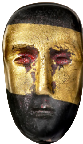
ODEN Series "Brains"

7090898 Sculpture H 75 mm Ø 45 mm Black/gold