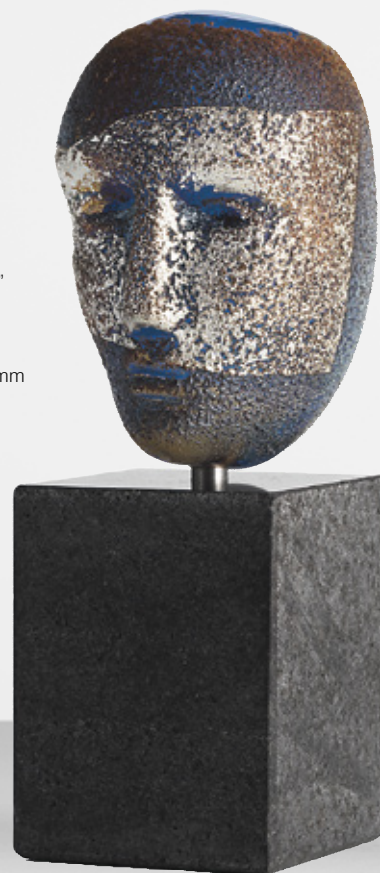
7520103 Sculpture H 135 mm B 55 mm D 45 mm Silver/blue