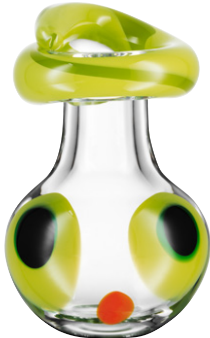
NOTHING MUCH Serie "What's Up?"

7670011 Sculpture H 195 mm Ø 280 mm Multicolored