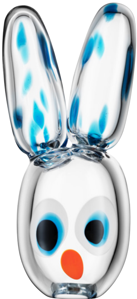
I DON'T KNOW Serie "What's Up?"

7670007 Sculpture H 305 mm Ø 120 mm Multicolored