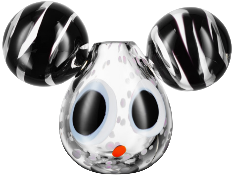
ASK HER Serie "What's Up?"

7670011 Sculpture H 195 mm Ø 280 mm Multicolored