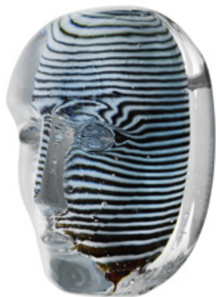
LOOK Series "Look"

A decorative collector's items intended for wall mounting with the included stainless steel clamp. Shaped by hand in the hot shop, then cut and polished. "Look In" have a cut-glass "window" which invites the viewer to look in. Paint and silver leaf are applied to the finished head. "Look", the white thread is spun on the inner feature and then heavily repolished. The stripes represent meandering lines of thought.