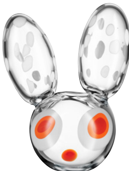
I AM HUNGRY Serie "What's Up?"

7670007 Sculpture H 305 mm Ø 120 mm Multicolored