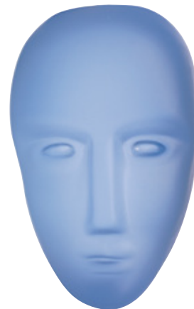
KAROLINA Series "Brains"

7090307 Sculpture H 75 mm Ø 45 mm Blue/silver