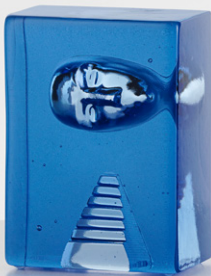
STAIRS Series "Azur"

Azur is a series of cast and cut objects blue as the sea. A staircase, a moon, a human being. Figures who have been visiting and left their mark in various ways.